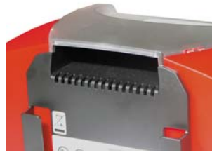
Non slip rear manual grip