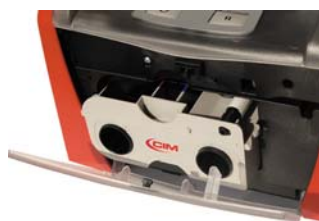
Ribbon cartridge EasyLoad

As many as 56 different configurations are available !